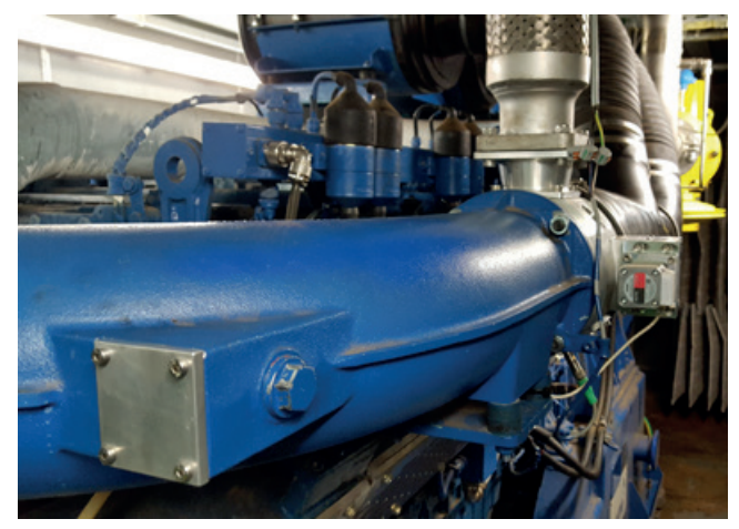
3 VariFuel2-TEM with stepper motor