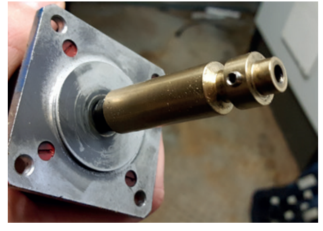
1 Rods on flowbody