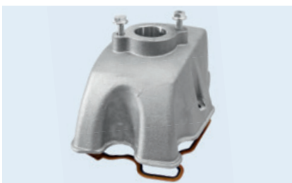
Valve cover with flange support and valve cover gasket