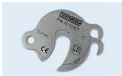
Safety flange kit for spark plug lead