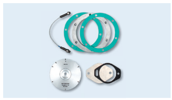
Trigger conversion kit, pickup and magneto flange cover (G3304/06 and G3406)

The Century of Ignition Magnetos is Over. Move Forward to the Latest Generation of High Energy Ignition!