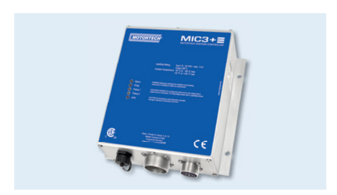
MIC3+ series ignition controller