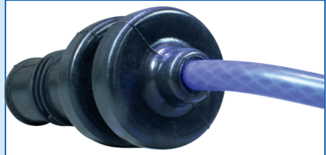
Improved sealing prevents water leaking into the boot