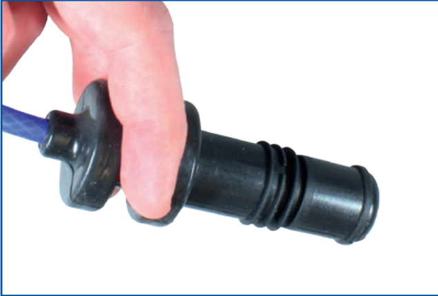
No need to pull out boot by pulling on the wire