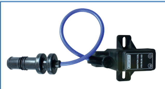
Use of flexible MOTORTECH silicone spark plug wire