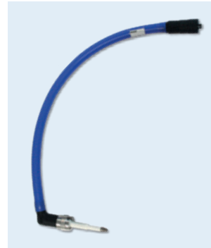
Unshielded Safety Lead P/N 09.02.4001-20