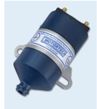
Ignition Coil P/N 06.50.055