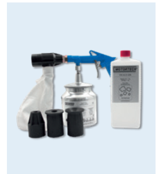
Spark Plug Cleaning Kit P/N 44.01.023