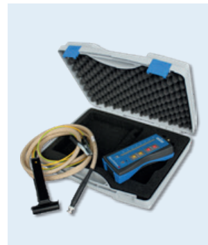
SparkView High Voltage Indicator P/N 06.50.099-100