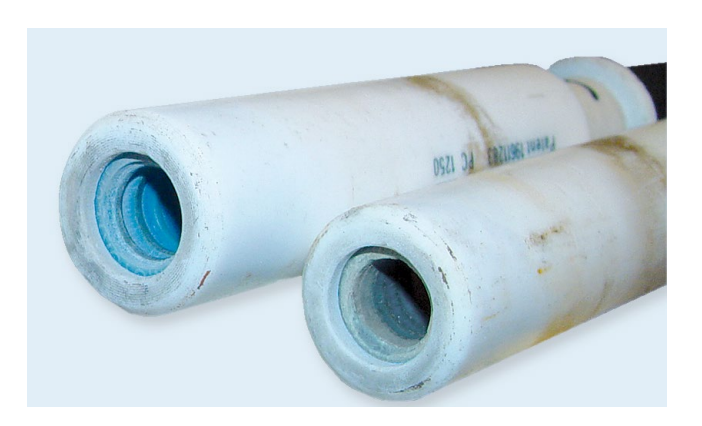
Proper insulation is no longer provided and replacement is necessary for further operation.

The aged and formerly blue seal rings are porous and show a distinct discoloration.