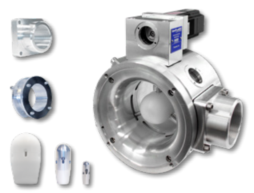
VariFuel2 - Accessories

The stepper motor driver control developed by MOTORTECH guarantees the ideal control of the various types of MOTORTECH VariFuel2 air/gas mixers and throttle bodies with integrated stepper motor.