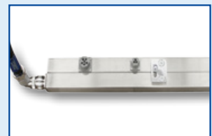
Rail combination for ignition and detonation wiring incl. brackets