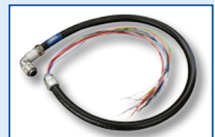
Separate connecting harness to main junction box