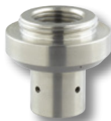
Weld Hub P/N 19.60.023

To increase lifetime of these critical sensors, there is a stainless steel hub available, which is welded to the exhaust pipe and takes the sensor out of the dirty exhaust gas stream. A heat shield can be screwed on top of the weld hub. This way the sensor does reach directly into the heat shield protects the sensor against transient temperature from the hot exhaust manifold.