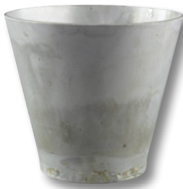
Heat Shield P/N 19.60.022