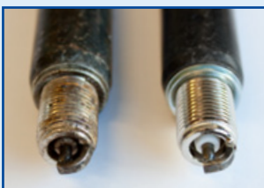
Spark plug after use and after cleaning

Try the alternative. Call the nearest MOTORTECH sales partner for more information.