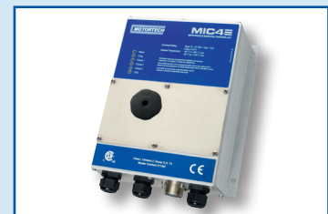
MIC4 series ignition controller