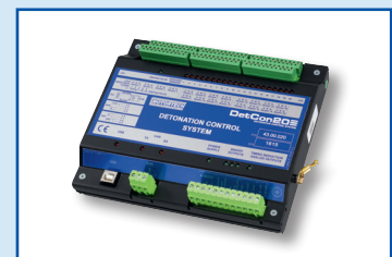
DetConzo detonation controller