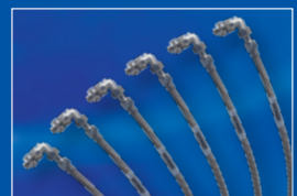
Shielded primary leads